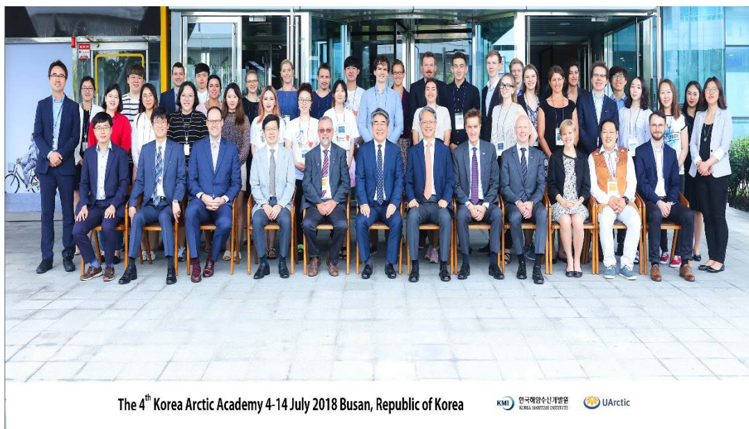
The 4 th Korea Arctic Academy 4-14 July 2018 Busan, Republic of Korea