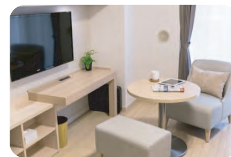
MYSTAYS PREMIER RESIDENCE SHIBA